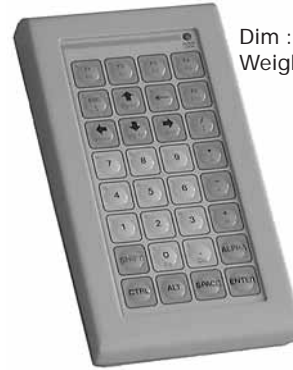
Dim : 204x106x42 mm Weight : 0.8Kg