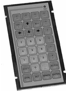
Weight : 0.3Kg