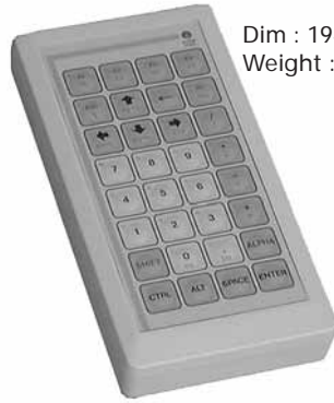
Dim : 194x100x28/44 mm Weight : 0.5Kg