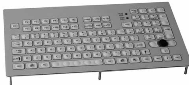
Dim: 314 x 180 x 20 mm Weight: 0.5 Kg