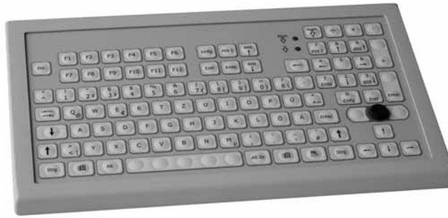
Dim: 328 x 204 x 42 mm Weight: 2.0Kg